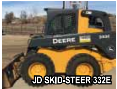
JD SKID-STEER 332E