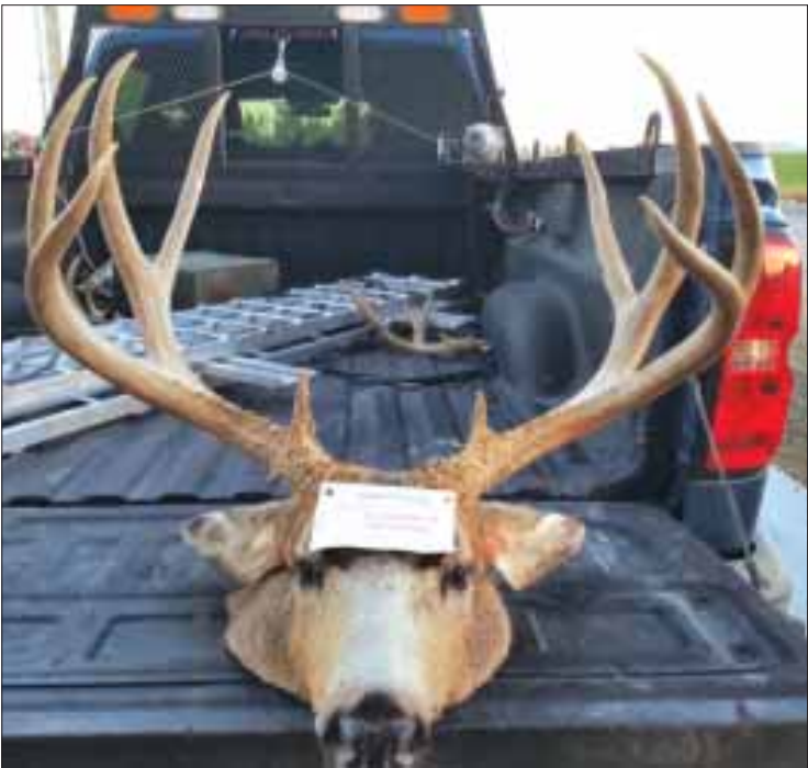
The head of the illegally taken buck sits tagged as evidence on the tailgate of an Idaho Fish and Game patrol truck.