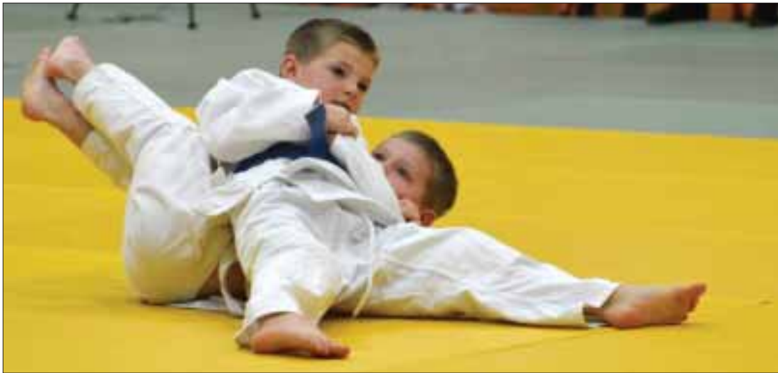
A young judo student looks to his coach during an early-round match in Saturday's tourney.