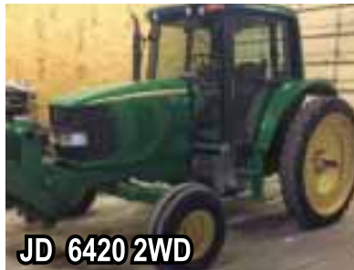
JD 6420 2WD