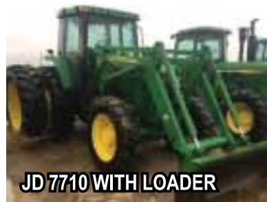
JD 7710 WITH LOADER