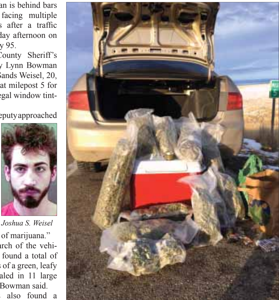
Nearly 14 pounds of marijuana and other contraband, valued at as much as $15,000, was found after a traffic stop on U.S. Highway 95.