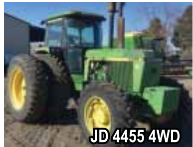
JD 4455 4WD