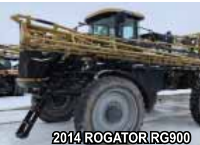
2014 ROGATOR RG900