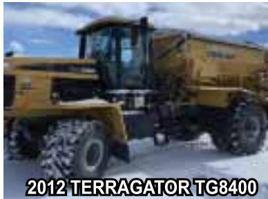
2012 TERRAGATOR TG8400