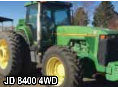
JD 8400 4WD