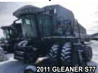
2011 GLEANER S77