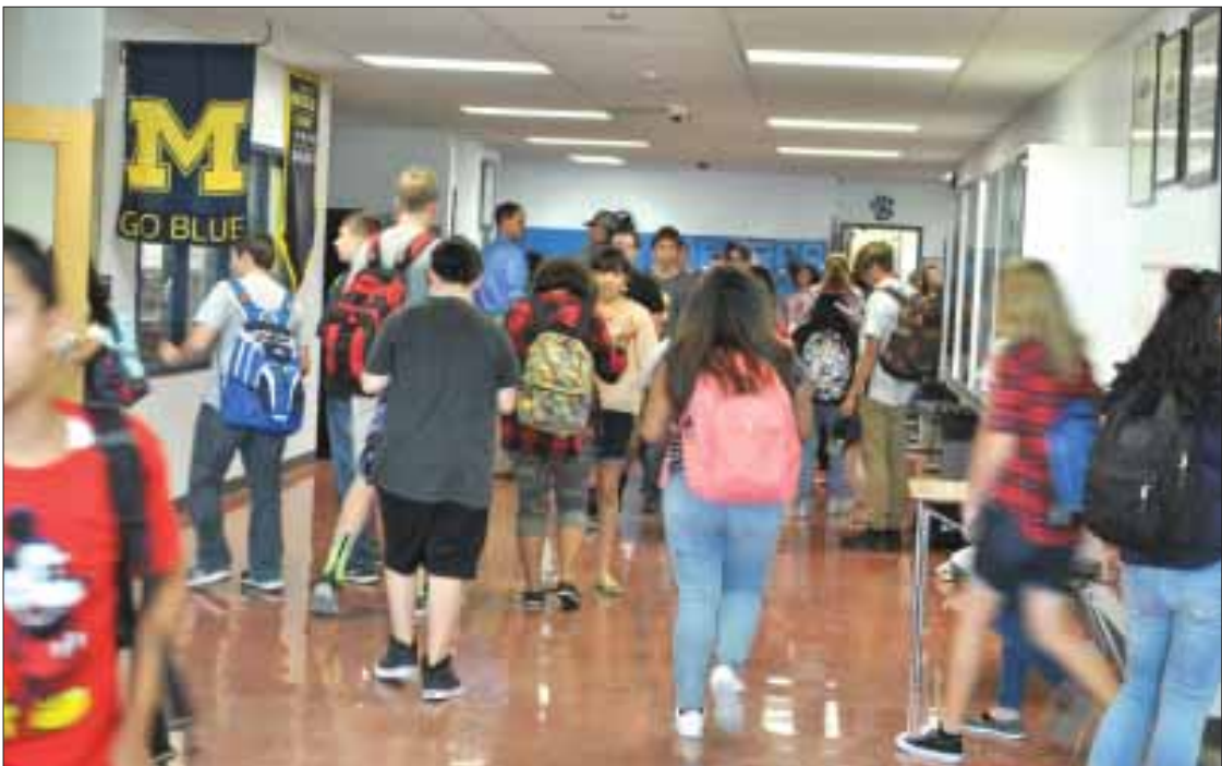
The halls of Marsing High School were once again buzzing with activity on the first day of the new school year last Wednesday.

Stewart said the district office is on track to be relocated to a temporary location inside the old home economics room on the main floor of the high school by Oct. 1. Once the new middle school construction is complete, the district office will be moved into the