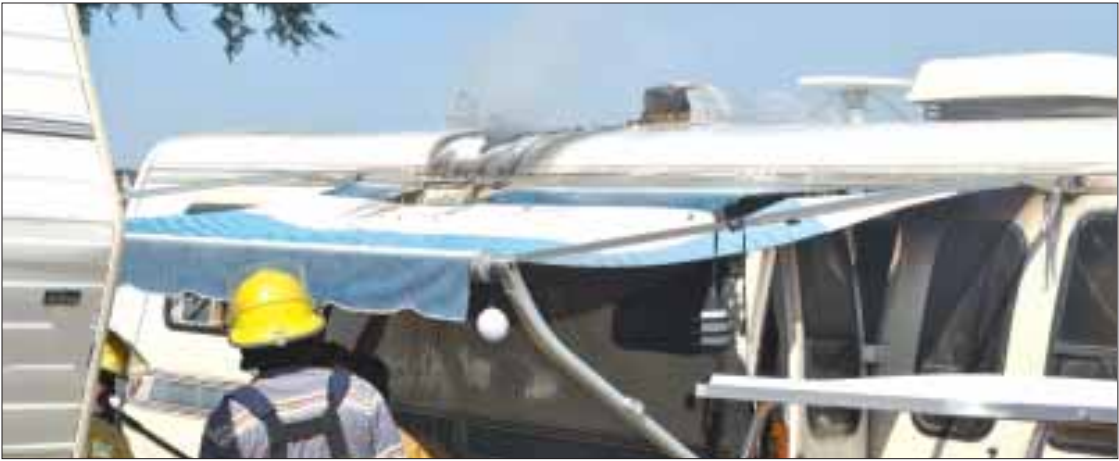
Marsing Rural Fire Department volunteers assess damage to a recreational vehicle after a fire at the Riverhaven RV park southeast of Marsing last Wednesday.