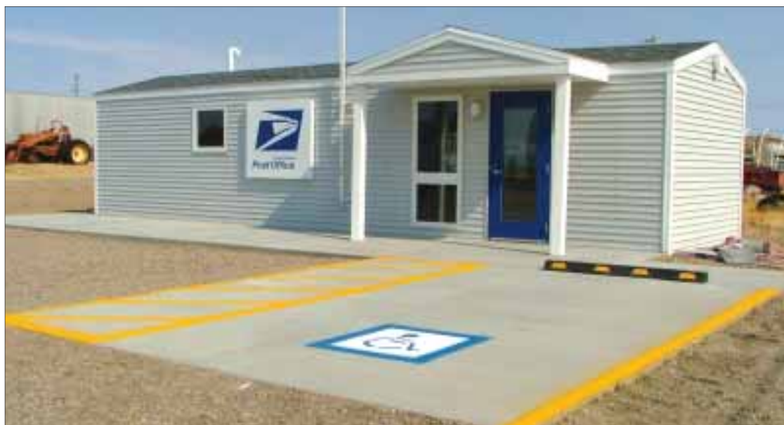
A modular building, like this one in tiny Ingomar, Mont., 110 miles northeast of Billings, could be the future of postal service in Murphy.

The plan is to truck in a 4,084-square-foot "compact facility" to restore window service in the only county seat