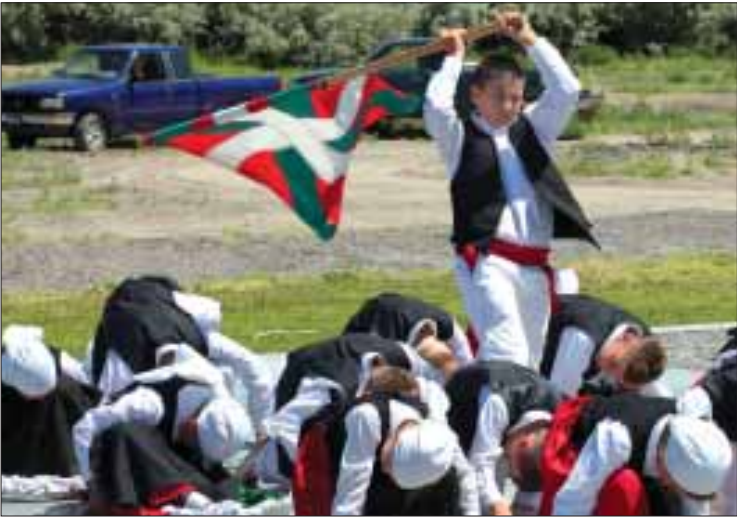
The final performance of the afternoon featured both Herribatza Dantzariak and Boise-based Oinkari Basque Dancers. To view more photos from Sunday's event visit The Owyhee Avalanche website.