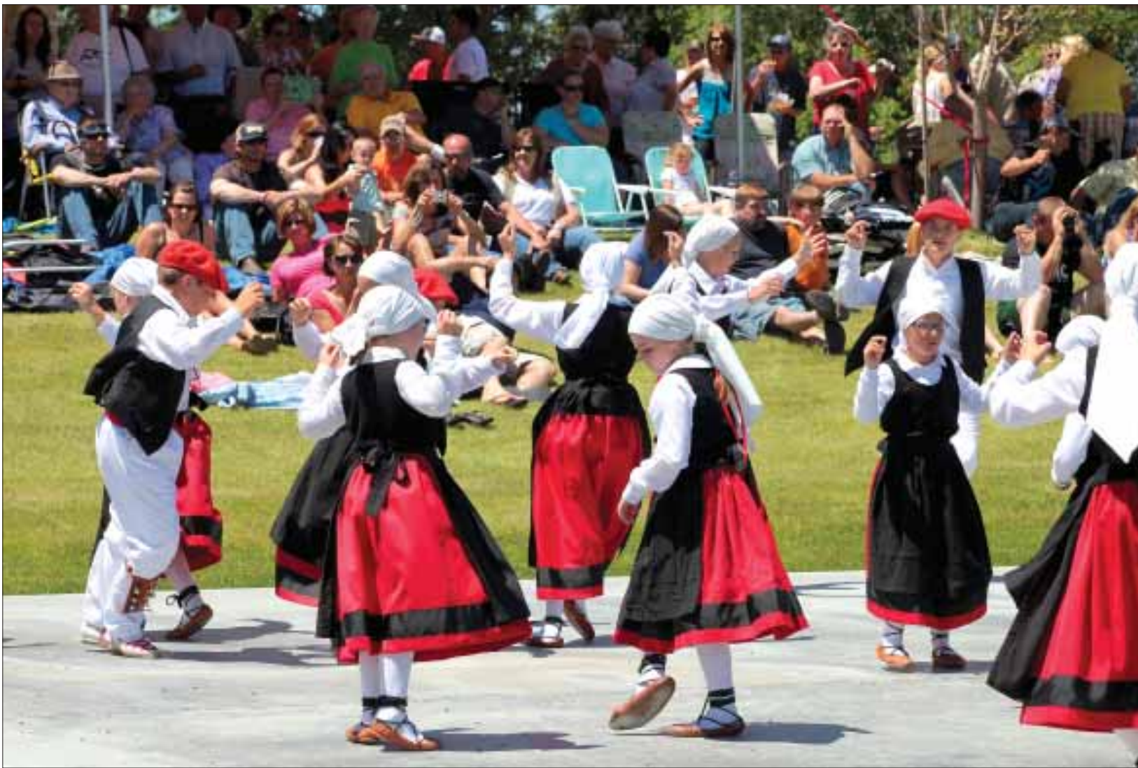
Herribatza Dantzariak dancers perform during the Txoko Ona picnic on Sunday afternoon.