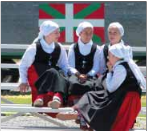
Herribatza Dantzariak dancers take a break before their next performance on Sunday during the annual Txoko Ona picnic.