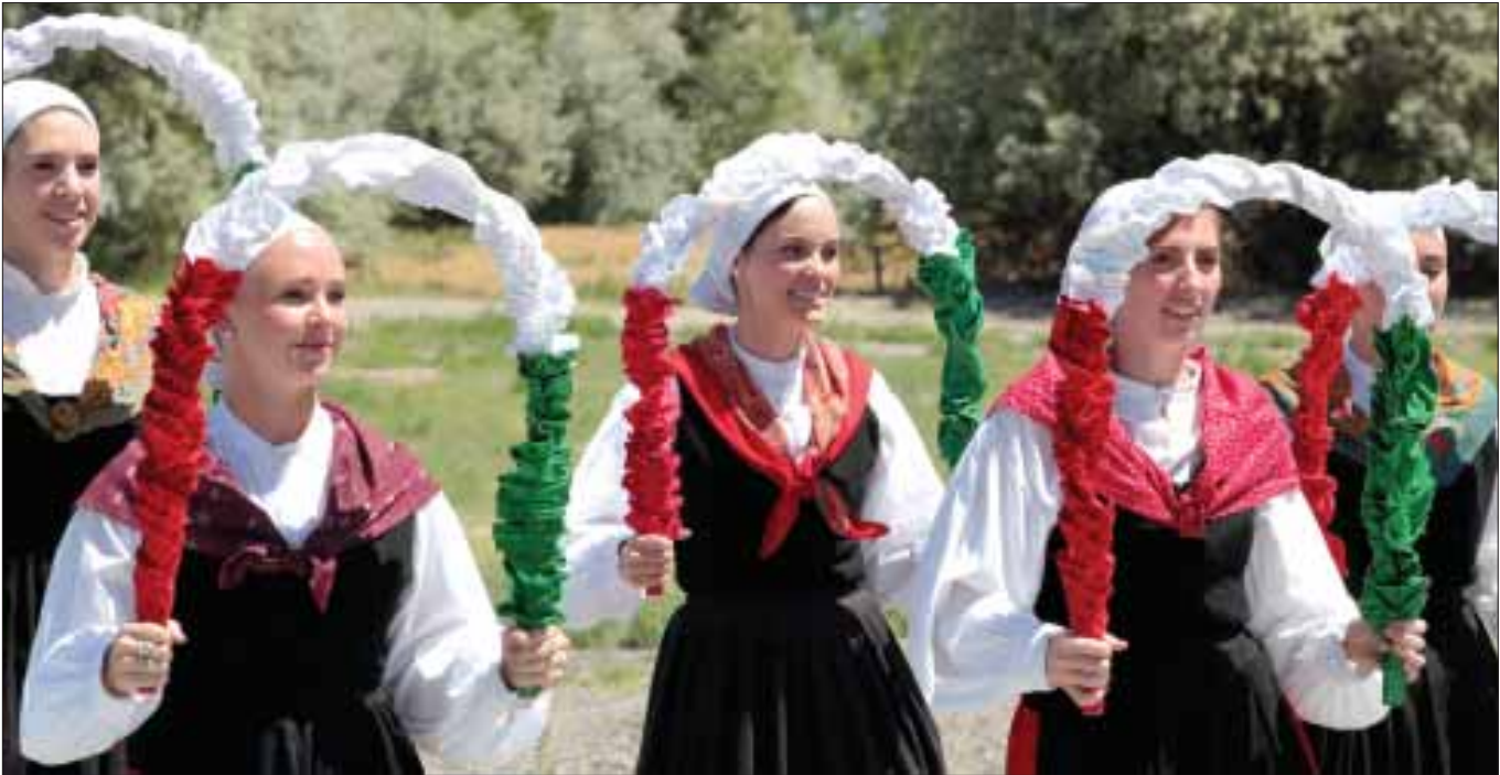
Women from the Boise-based Oinkari Basque Dancers perform Uztai Txikiena on Sunday at the Txoko Ona Basque Center.