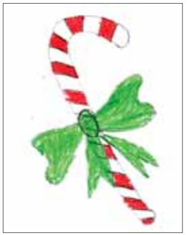
Brady Trout, Homedale Elementary