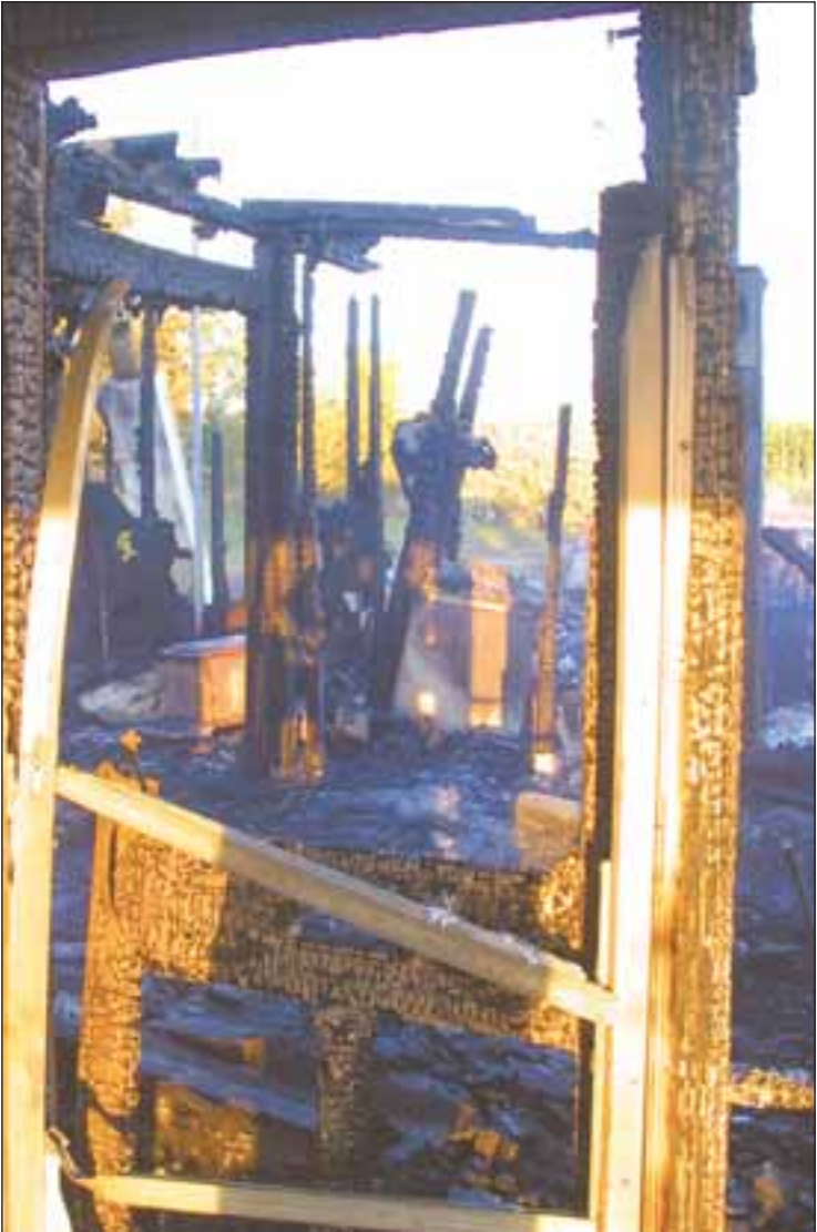
Smoldering remains Looking toward what used to be the living room of a home that burned down last Tuesday morning. A 57 year old Homedale woman was killed in the fire and investigators ruled the blaze an accident.