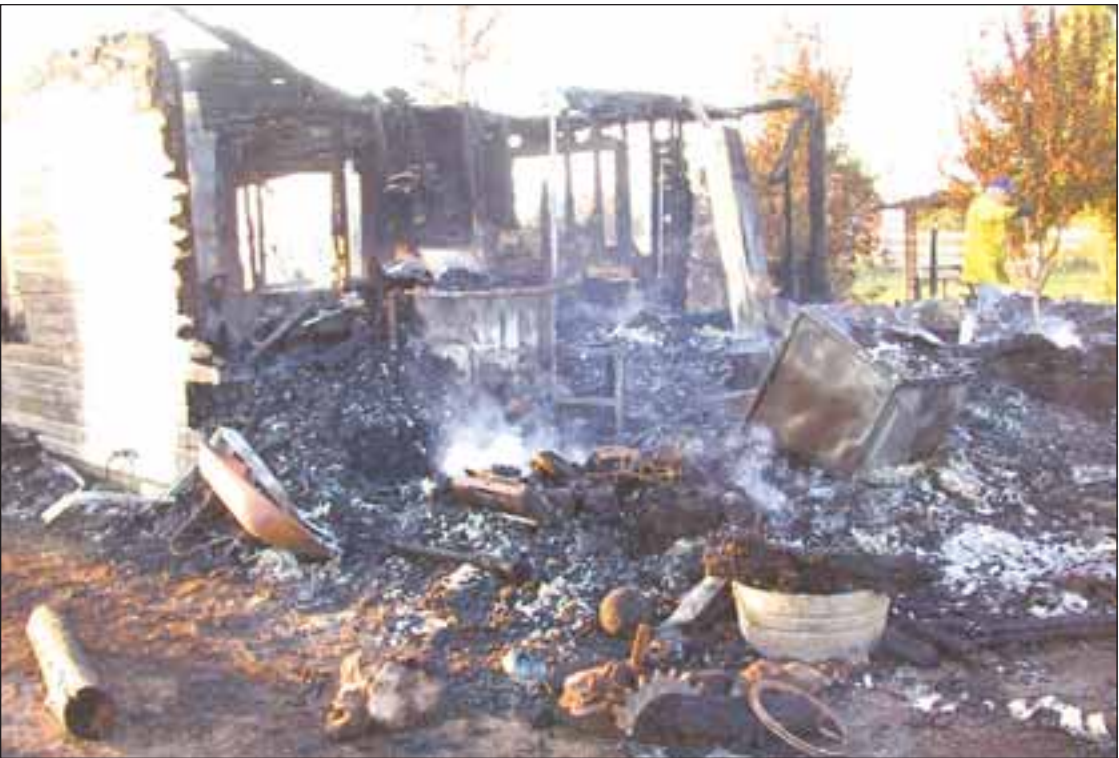
Scorched The scorched remains of a home on Maas Lane outside of Homedale is all that was left last Tuesday morning after fire ripped through the home killing a 57 year old Homedale woman.